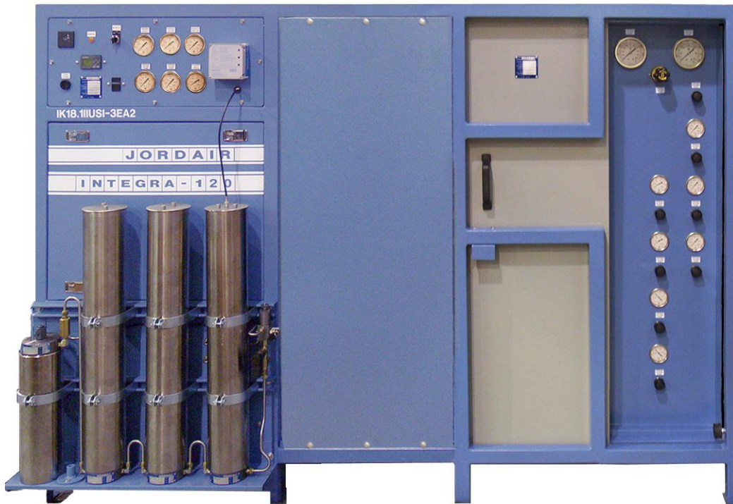
Unit photo with JP91-5000-4S filter Features a 2-year System and 5-year Block Warranty